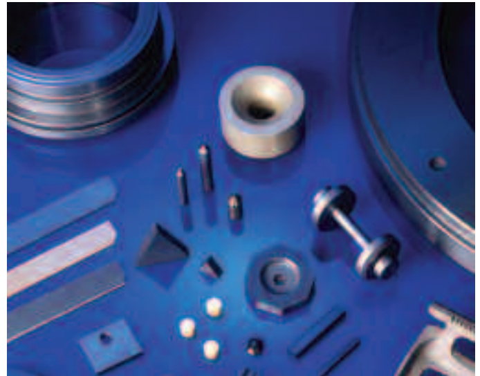
Typical parts finished by diamond wheel grinding.

As seen in Figure 1, if the wheel is fed into the work piece deeper than the exposed diamond length (i.e., if D_c > D_L ), damage to either the grinding wheel or the work piece will result. In cases where D_c = D_L , a considerable amount of heat is going to be gen-